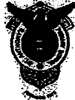
St Anthony's Primary School